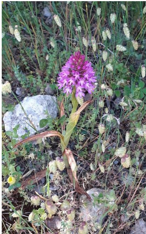
Orchid Italica next to the recycling bin